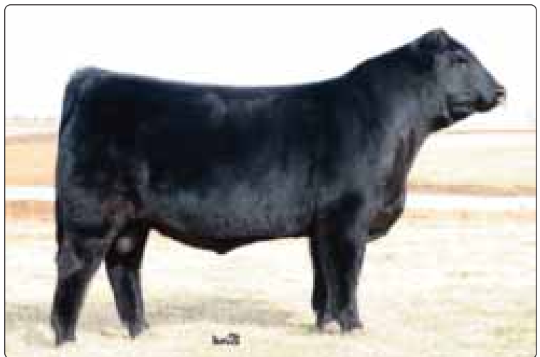
DALT Absolute Anarchy, sire of Lot 7A.