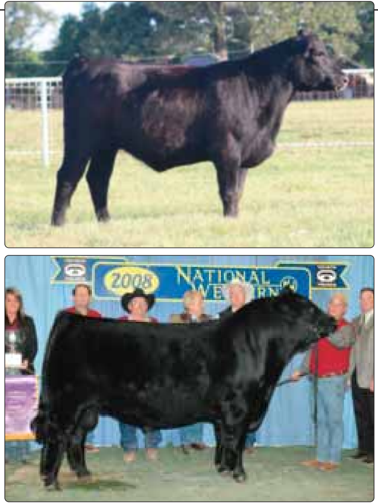
DHVO Deuce 132R, sire of Lot 43.