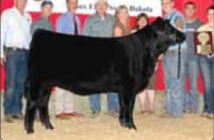
SSCL Tara 04T, dam of Lot 61 embryos.

RLBH Air Force One, sire of Lot 61 embryos.