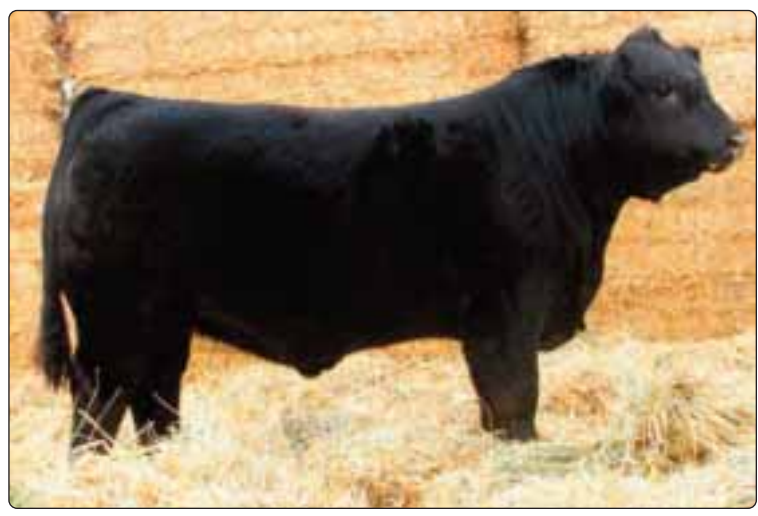
COLE Zone 89Z, service sire of Lot 13.