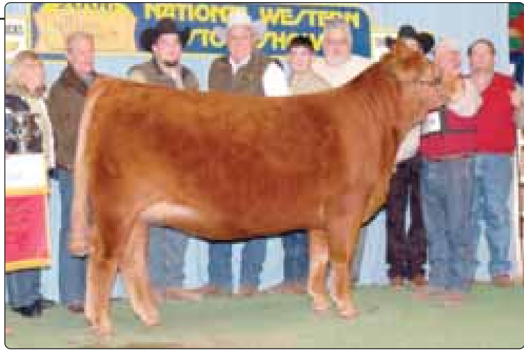
MAGS Prom Night, dam of Lot 27.

Consigned by Counsil Family Limousin, Madisonville, TX