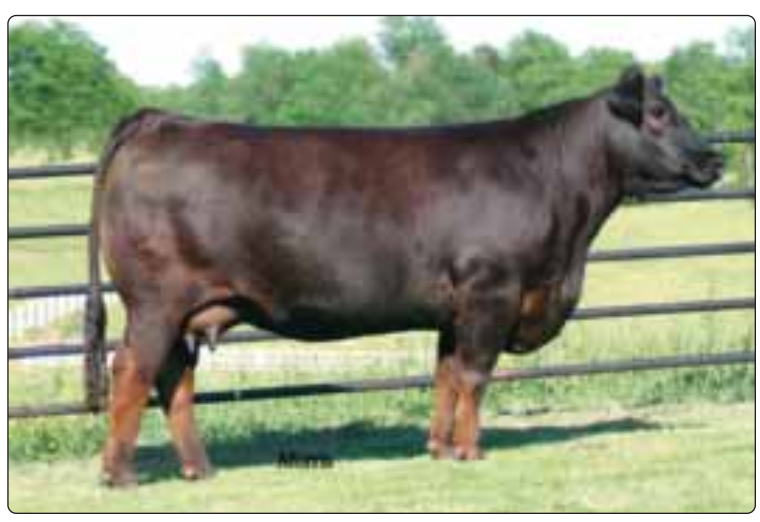
AUTO Manuela 298S, dam of Lot 9.