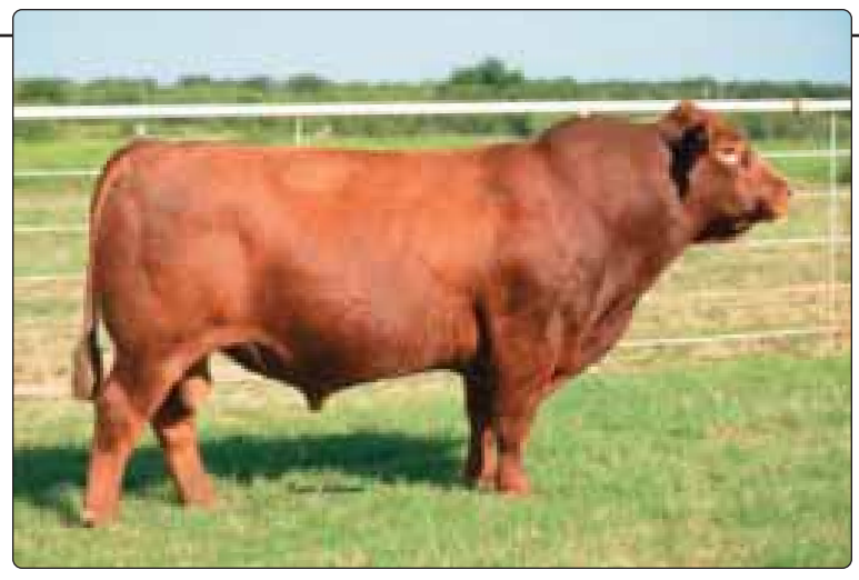
DL Rockstar 41Z, service sire to Lots 49 and 50.