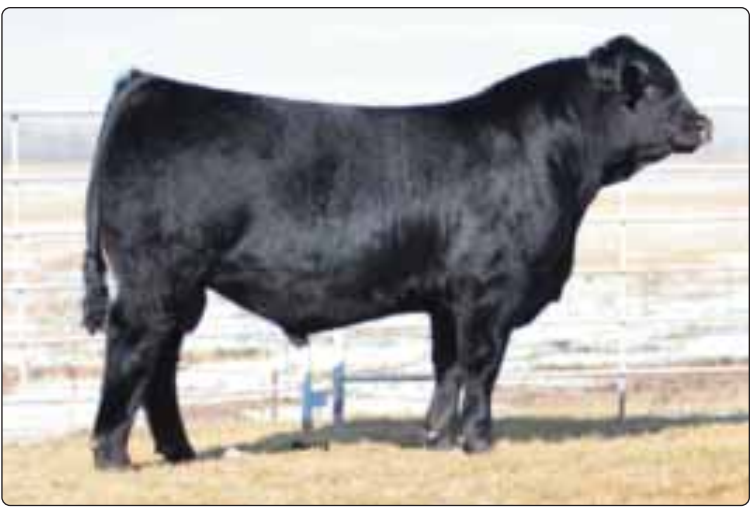
MAGS Acapulco, sire of Lot 55.